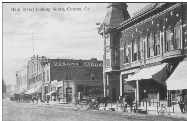
Corona, Downtown, 1890s.